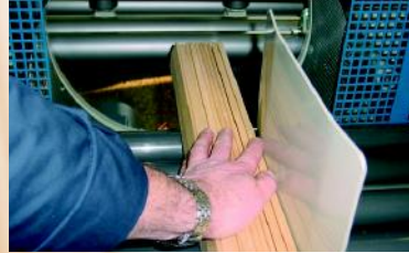
Semi automatic BSB-45 SX2 with 125mm packing material