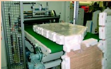
Automatic wrapping of table tops or working tops with corner protection