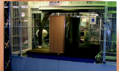
Packaging of kitchen cabinets and mounted furniture