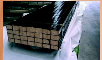
Complete pack of wrapped single bars with UV protection film