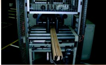
Fully automatic JUNIOR/S-450VA with 125mm packing material