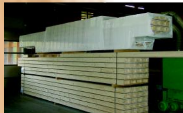
Packing of uneven product shapes with height adjustment or power prestretch systems