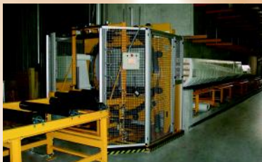
Inline solution for complete packs of laminated beams. Additional bandages to save the manual strapping