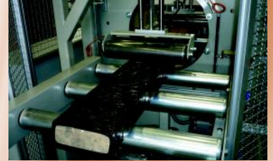
Highspeed solution with 250mm packing material width