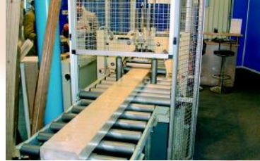
JUNIOR/S-450VA inline solution