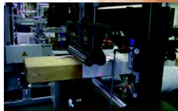
Wrapping of single bars with highspeed application up to 60m/min